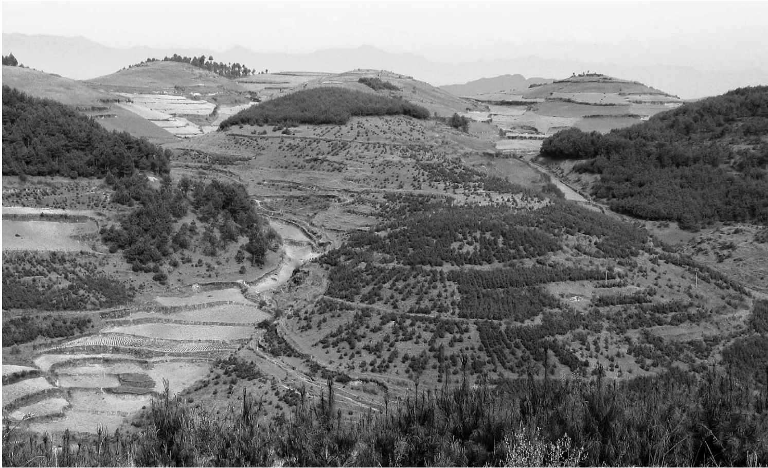
FIGURE 1 Example of changing landscape patterns in the study area: terraces for seasonal crops are interspersed with patches of pine planted on former farmland.

years residents with a rural housing permit ( hukou ) were unable to find employment in urban areas. Migration regulations have been relaxed over the last decade, so that short-term relocation, especially for unofficial employment, is much easier. As more rural residents were allowed and encouraged to seek off-farm employment, the number of workers in the agricultural sector dropped steadily during the 1990s (Guang and Zheng 2005). This shift in rural economic options is occurring at the same time that reforestation limits the availability of arable land, and may be encouraging the diversification of farming households' labor and resource allocation.