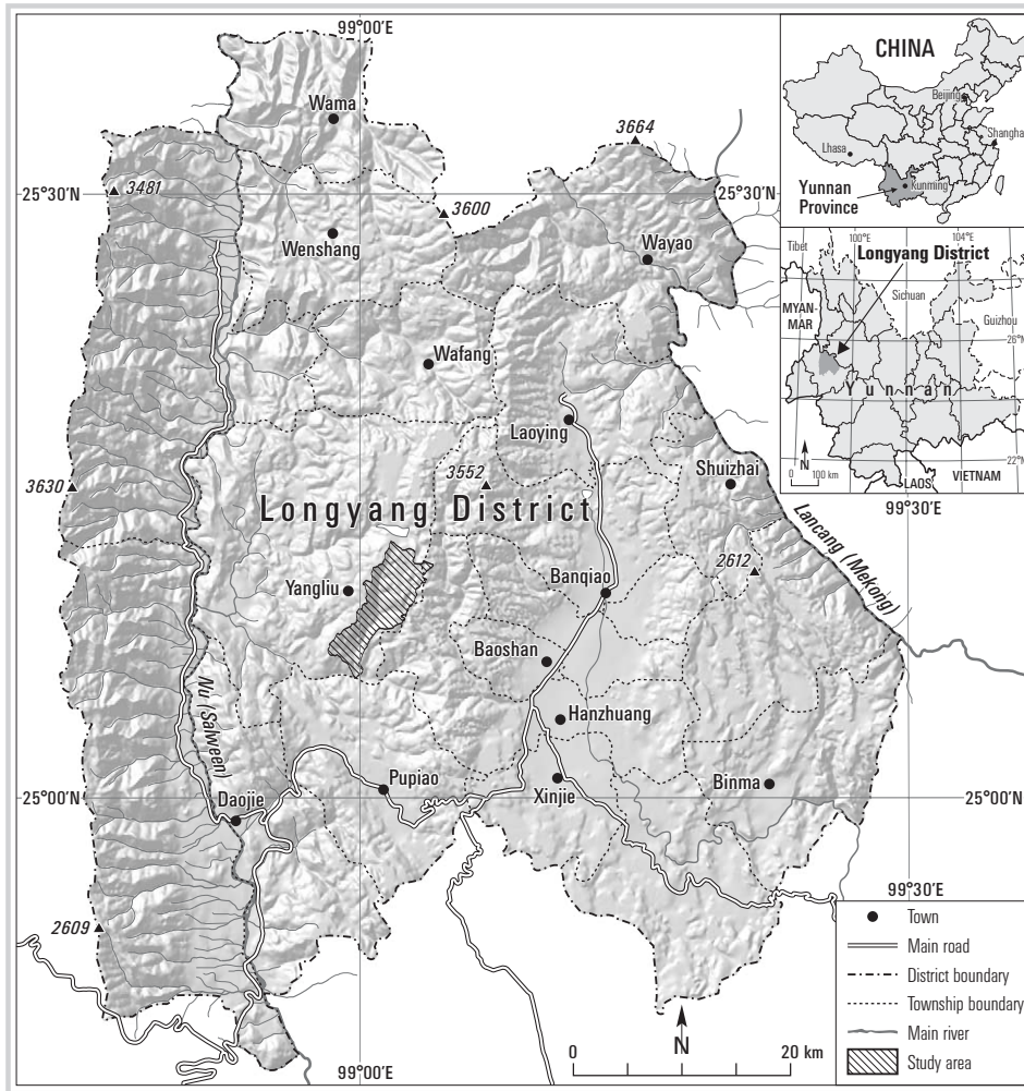
FIGURE 2 Location of Yangliu watershed, situated in Baoshan Prefecture, Yunnan, China. (Map by authors and Andreas Brodbeck)