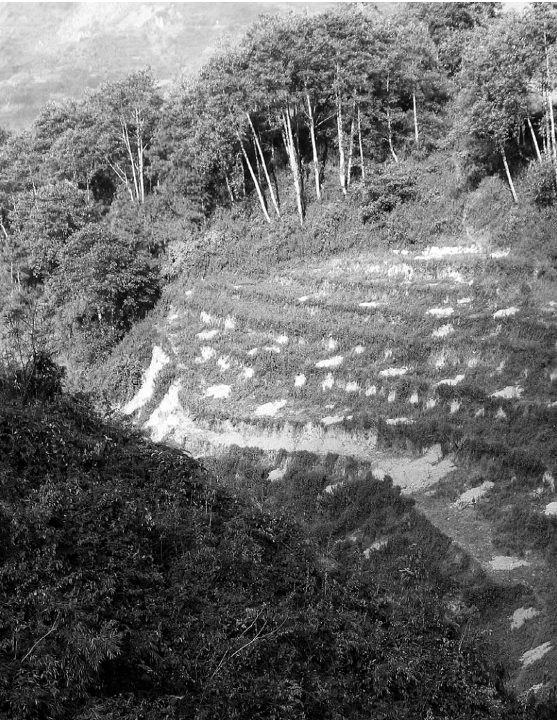
FIGURE 5 Terraced farmland prepared for planting walnut seedlings in the study area.

listed several reasons for deciding to convert their cropland to trees: the most frequently mentioned were “location too far from house,” “low yield due to soil infertility or cold climate,” and “landslides.”